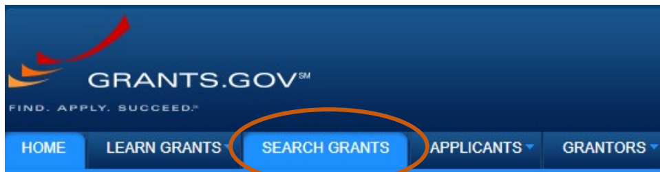
Figure 1: Grants.gov homepage